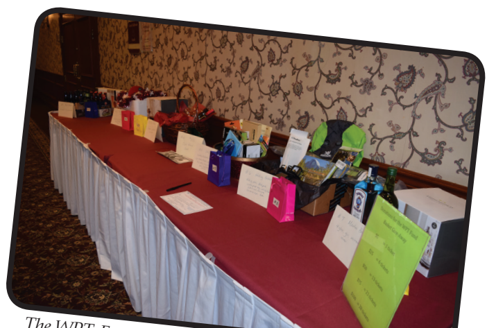
The WPT-Fund basket raffle raised funds for PT student scholarships. Thanks to all who purchased tickets or donated!