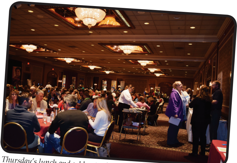
Thursday's lunch and sold out exhibit hall was packed. Attendees had the opportunity to network and check out the vendors.